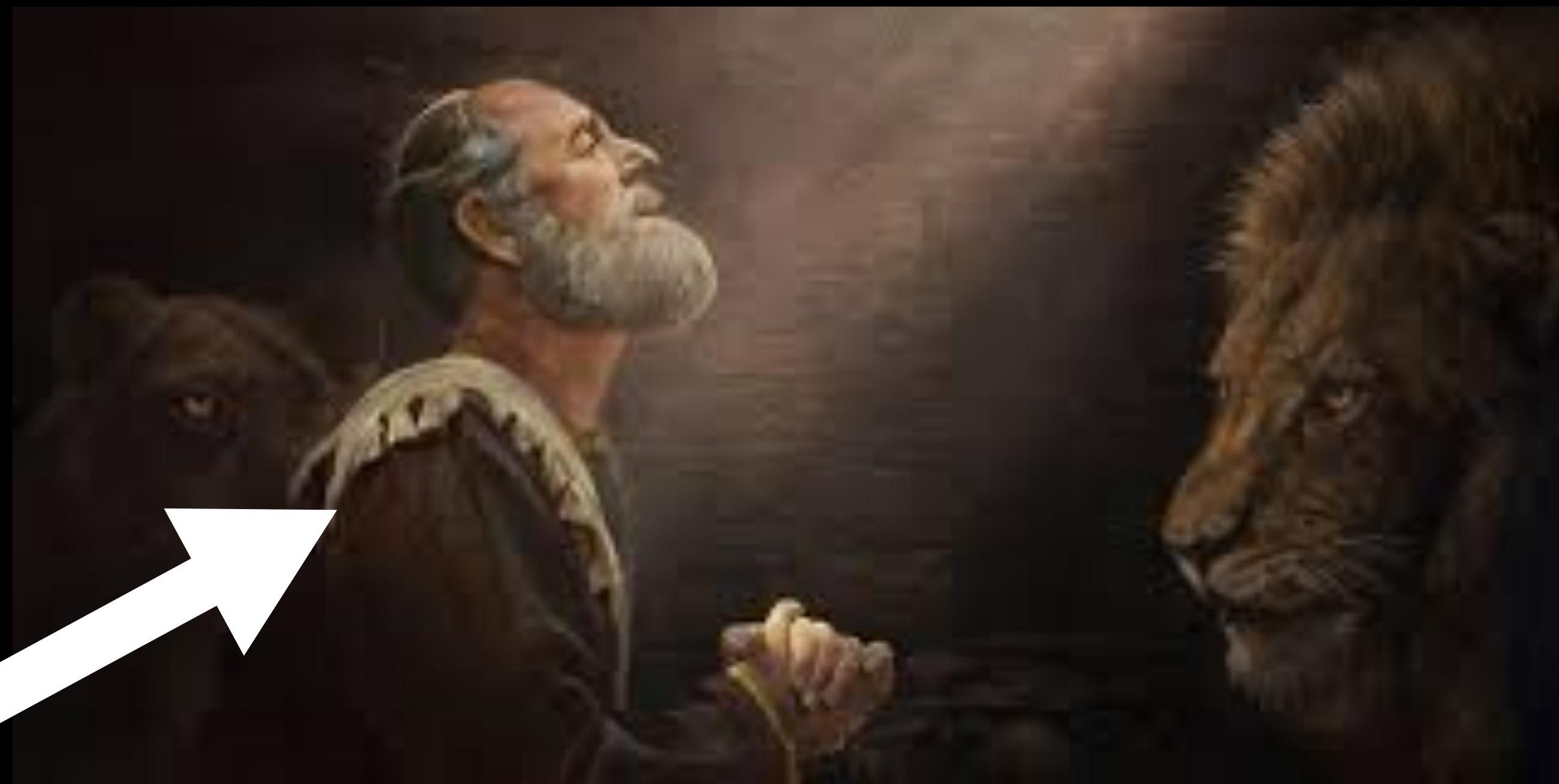
old Daniel's heart-set